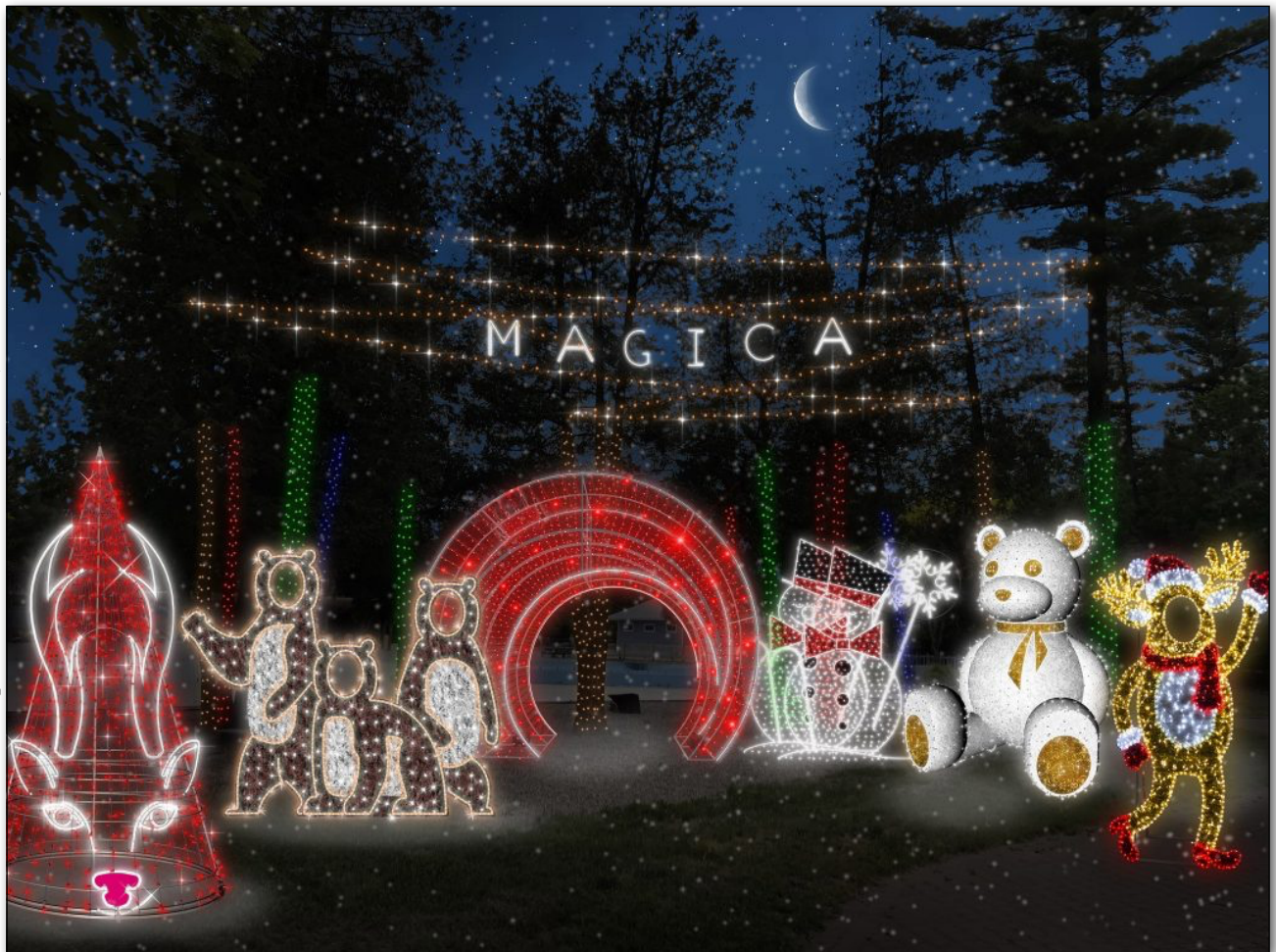
Source : Site Internet : https://tourismehautrichelieu.com/ (Féerie au Parc Safari)

Happy 2023! Our best wishes for your health and happiness!