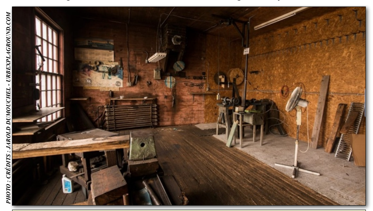
The workshop was built towards the end of the XIX^{TH} Century.

The bend in the Côte Fréchette street was reconfigured before 1960 and traffic was redirected from the front to the back of the building, and that is why it looks as if the building structure is below the level of the street. The face of the building abuts Davidson Hill (now called Côte Fréchette), which is a very busy arterial road linking Côte du Passage with the commercial area surrounding the Ferry Terminal.