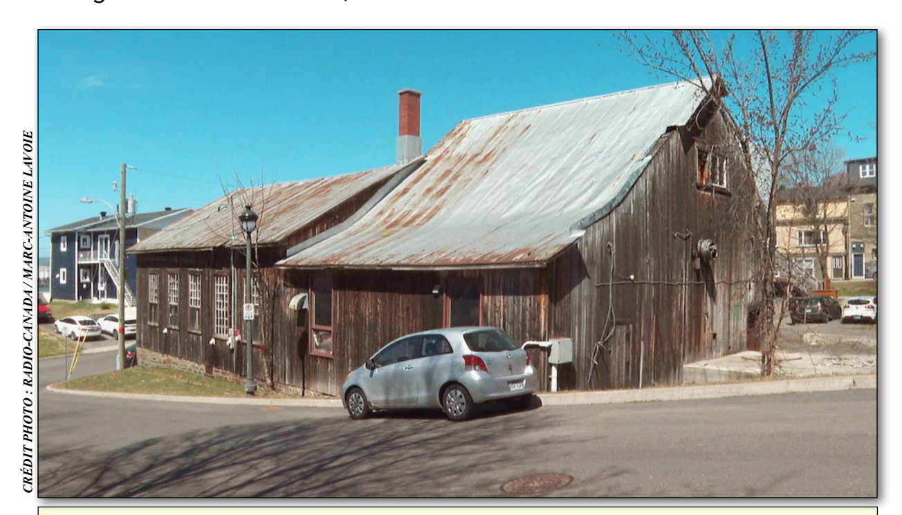
Located in Vieux-Lévis, the Scies Mercier building was about to be demolished to make room for new condos.

In 1891, Napoléon Mercier created the Manufacture de Scies de Lévis , specializing in the making of various sizes of saws and knives. The business was at first located in a building on Saint-Laurent Street, in the Lowertown area of Lévis.