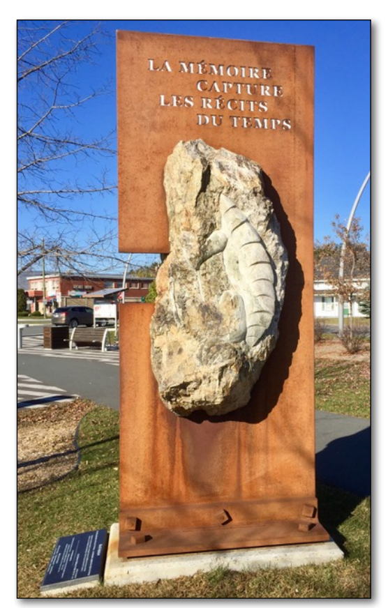
Récit épique Le temps qui passe estompe les traces... La mémoire capture les récits du temps. (réf.: page 9)

One of their most observable works, entitled Récit épique (Epic Tale) can be seen on the Promenade Redmond near the Lacroix-Dutil sports centre in Saint-Georges.