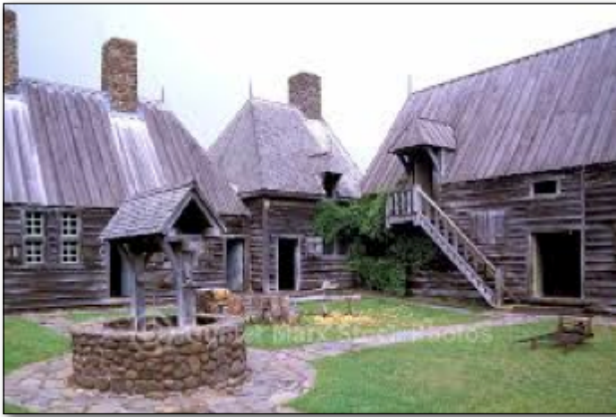
Port-Royal National Historic Site

Following the deportation of the Acadians in 1755, some descendants of the couple founded Bonaventure in Gaspésie. Others, exiled to Massachusetts, came back to Cape Breton where they worked as seamen or fishermen. Some can also be found in the Bécancour region in Quebec.