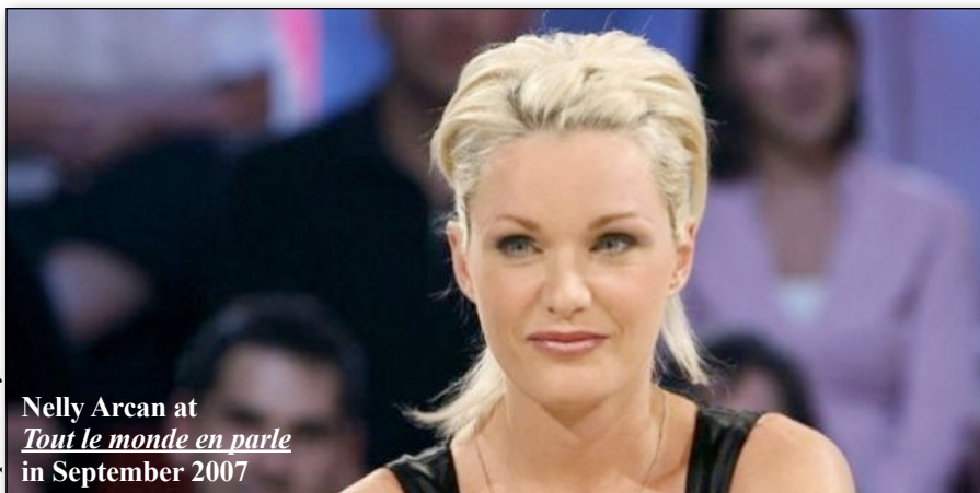
Nelly Arcan at Tout le monde en parle in September 2007

https://www.youtube.com/watch?v=Z9BvJPmMjxE