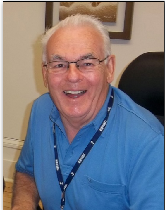
Picture taken at the 2015 Gathering, on September 10 at Saint-Roch-de-l'Achigan