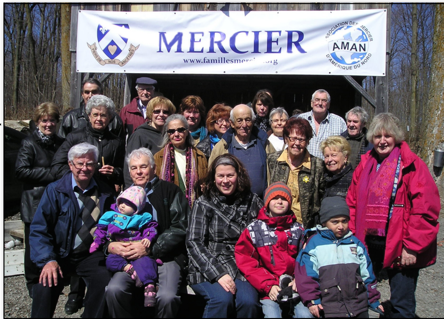
Gathering at the Sugar Bush shack in Saint-Esprit in 2012