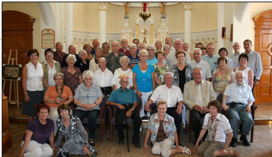
Annual Gathering of l'Association des Mercier in Saint-Georges in 2012