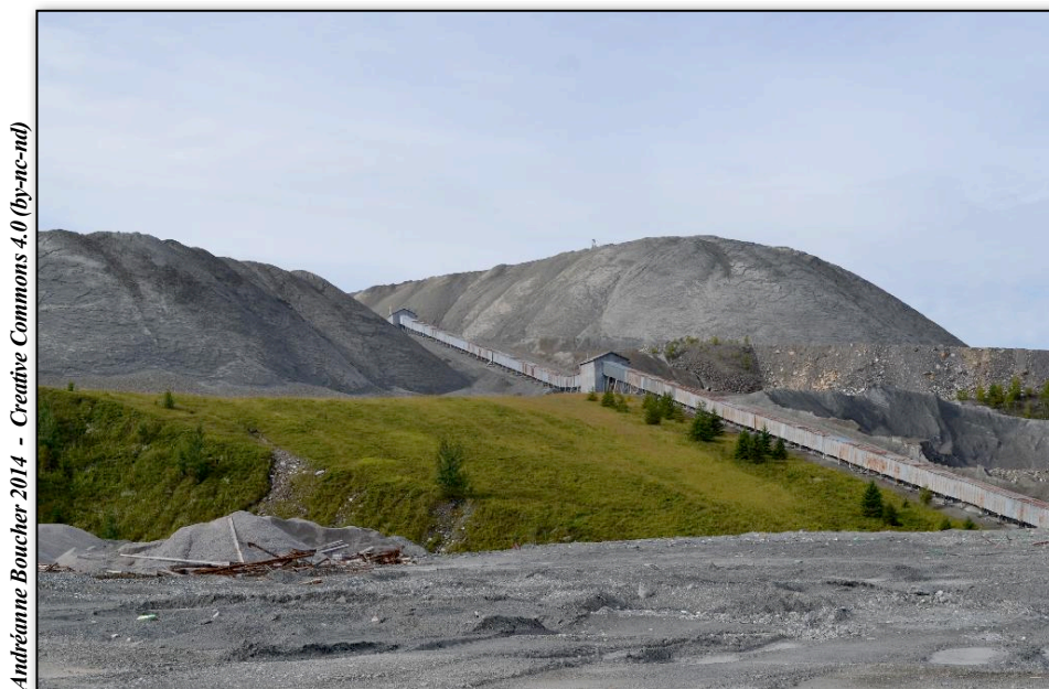
Andréanne Boucher 2014 - Creative Commons 4.0 (by-nc-nd)

Excerpts adapted from Dr Clément Fortier’s books, Black Lake Lac d’amiante 1882-1982, tome 1 and tome 2, 1986.