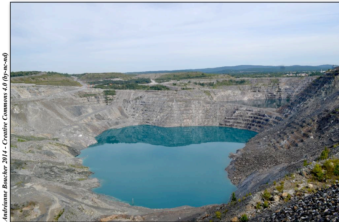
Andréanne Boucher 2014 - Creative Commons 4.0 (by-nc-nd)

A mine dump can also be found on the site, as well as several more mounds containing barren stone. They are named Kaiser, du Pont, 3 Monts and Épinettes. On the mine dump, there were two parallel conveyors, which were unfortunately dismantled and all that remain now are a few foundations. There is still however a third conveyor, that was used as an emergency back-up solution, in the event that one of the main conveyors broke down. The conveyors are covered with asbestos-cement panels.