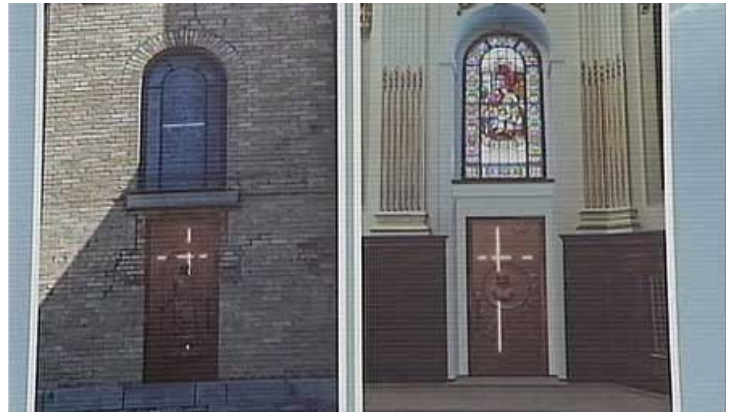
The Holy Door.

The parish of Our Lady of Quebec is rich in history, being the first catholic parish in America, north of the Spanish colonies. But much before the foundation of the parish in 1664, the inhabitants of the colony had started to write down their religious engagements in registers that are still preserved to our days. Our Lady of Quebec possesses the oldest registers in North America. They date from 1621.