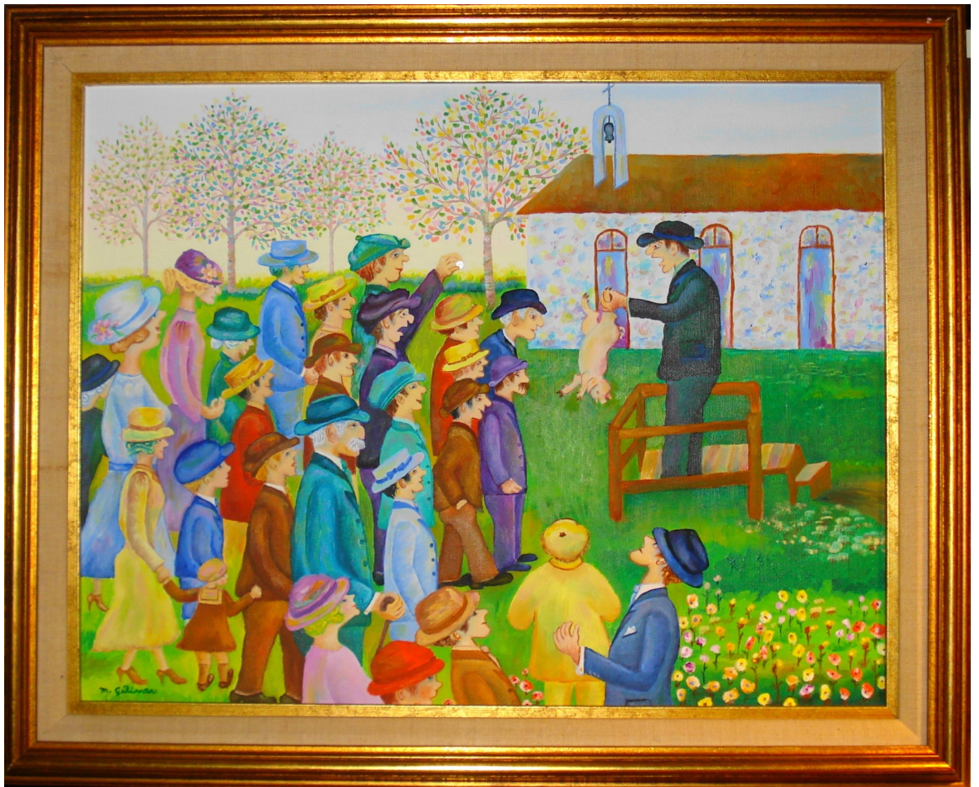
The Cry for Souls