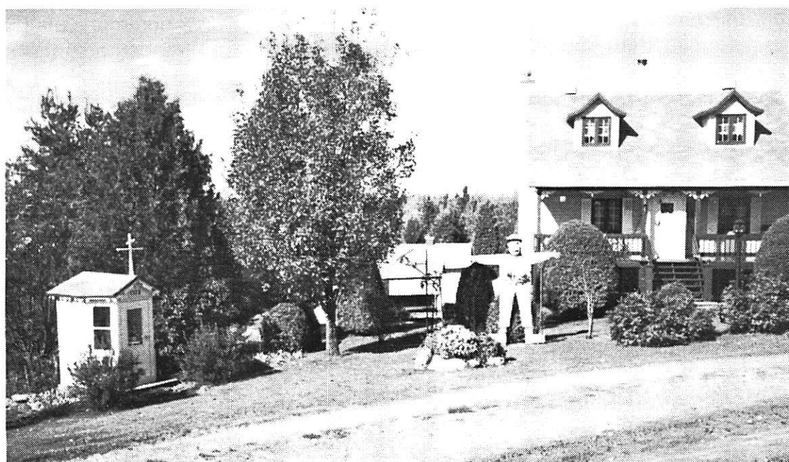
South-western view of the yard

The owners have laid out several yard improvements (double garage, wood shed, yard lamp, surface well for lawn and flowerbeds irrigation, trees and lawn) which improve the old house look.