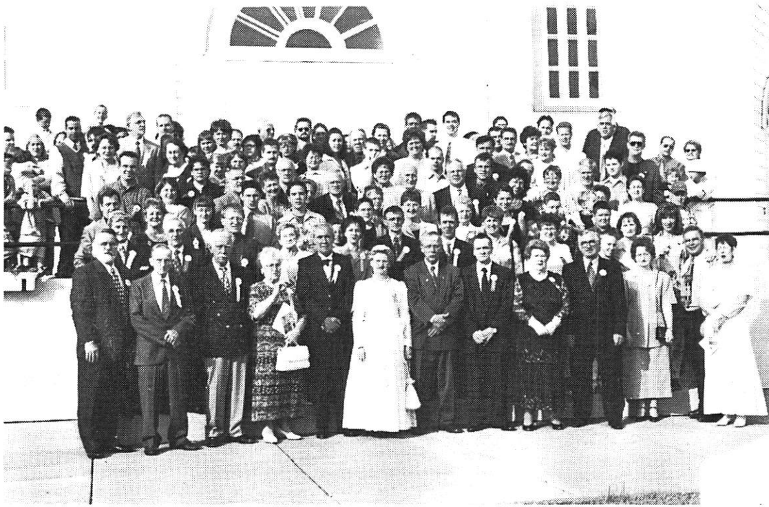
Participants Photo taken in front of the St. Magloire's Church

On the first row are found from the left to right: